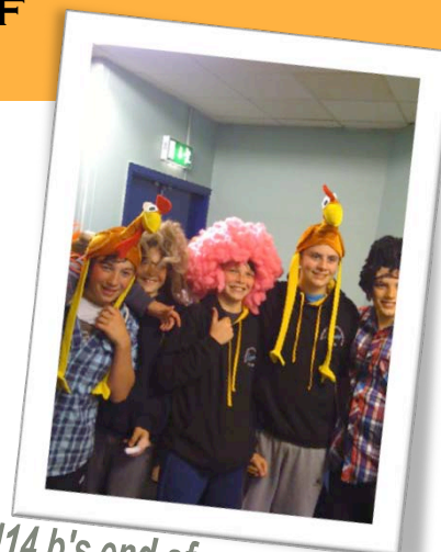
U14 b's end of season party!